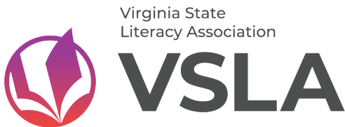
EXHIBIT OPPORTUNITY INCLUDES